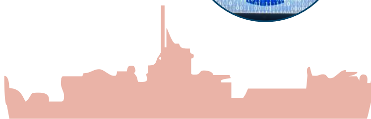
Light Amphibious Warship