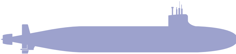
Columbia-Class - America’s No. 1 security priority