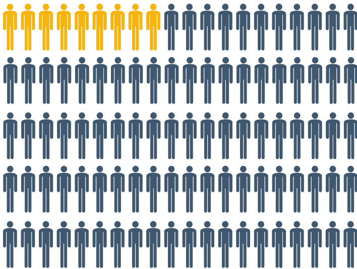
According to a recent Defense Department survey, only about 9% of young Americans capable of serving in the military had any desire to enlist.

The full impact of the pandemic, and its effects on military servicemembers and their families, will require years of continued study. However, some negative outcomes are already apparent. While deployments continued and the services adapted to the necessary precautions to reduce infections, a study by Booz Allen Hamilton found that there were increasing trends among military servicemembers and their families related to increased stress and diagnosed disorders, unmet mental health needs, declining spouse employment, and reduced access to childcare. Furthermore, a personal choice philosophy adopted by some service members resulted in their discharge for failure to receive mandated vaccinations, which exacerbated workforce shortages; the impact of this philosophical perspective on other workforce-related mandates in the future is undetermined and a possible risk area.