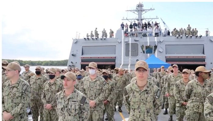
Crew move aboard ceremony on board the USS DANIEL INOUYE in Bath, Maine on May 28, 2021.

Please contact the Council office at (808) 422-9494 to see how you can be part of this exciting event!